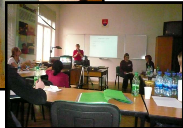
Welcome to ZeVeK training experience sharing